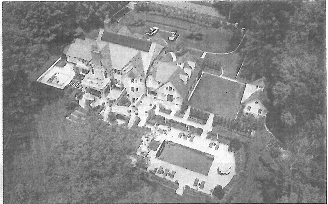
Hobbs, Inc., located on Grove Street, was awarded Fairfield County Project of the Year, for its work on the 10,000-square-foot luxury home pictured above. The awards are given out annually by the Home Builders Association of Connecticut. At right, the archstone bridge overlooks the cobblestone courtyard.

"When we started the house three years ago, 'green' was still relatively new to our marketplace so it was a great learning experience for us to research all these great products and seeing